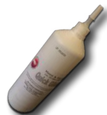
CABLE PULLING LUBRICANT